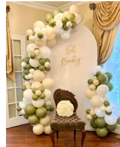
BALLOONS AROUND ARCH